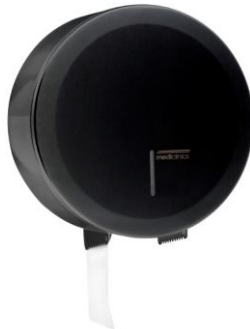
PR2787B Black epoxy finish