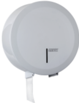
PR2787 White epoxy finish