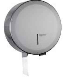
PR2787CS Satin finish