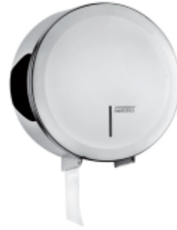
PR2787C Bright finish